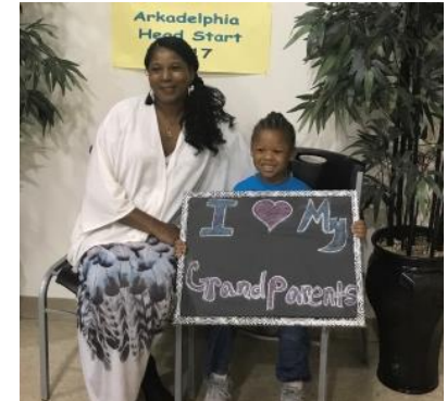
Arkadelphia Head Start Grandparents Day